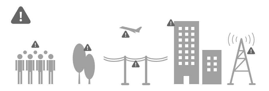
Fly Below 400 feet (120 m)

Avoid flying over or near obstacles, crowds, high voltage power lines, trees or bodies of water. DO NOT fly near strong electromagnetic sources such as power lines and base stations as it may affect the onboard compass.